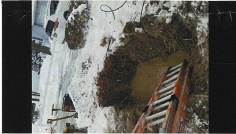
58980 - Investigator12.PNG