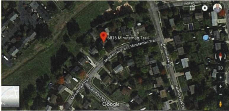
58980 - Investigator1.PNG