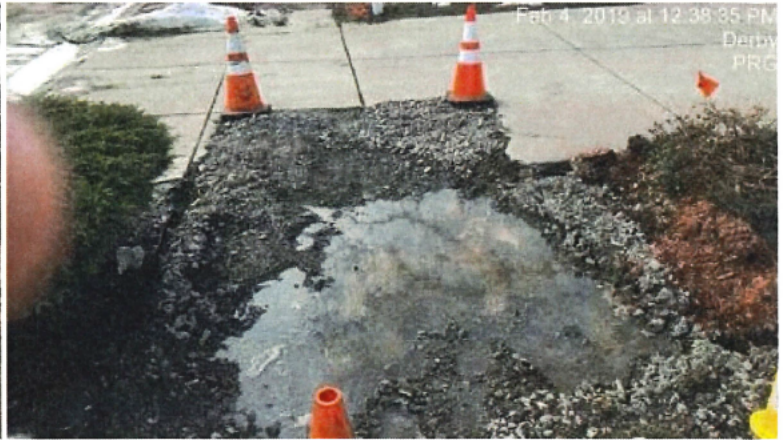
58980 - Investigator10.jpg