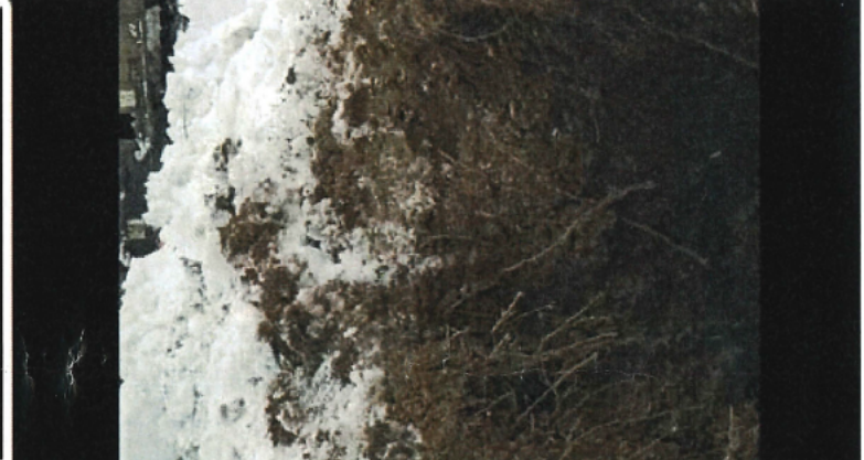
58980 - Investigator15.PNG