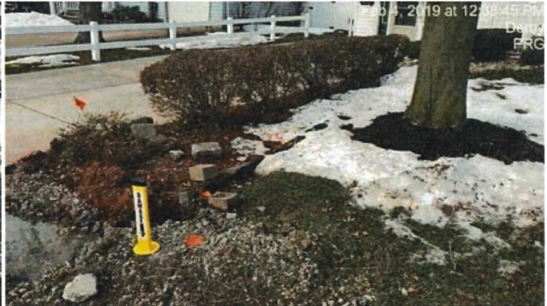
58980 - Investigator6.jpg