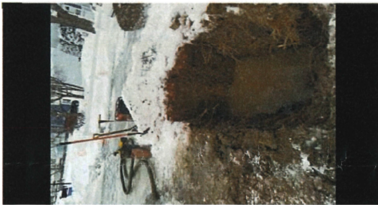
58980 - Investigator14.PNG