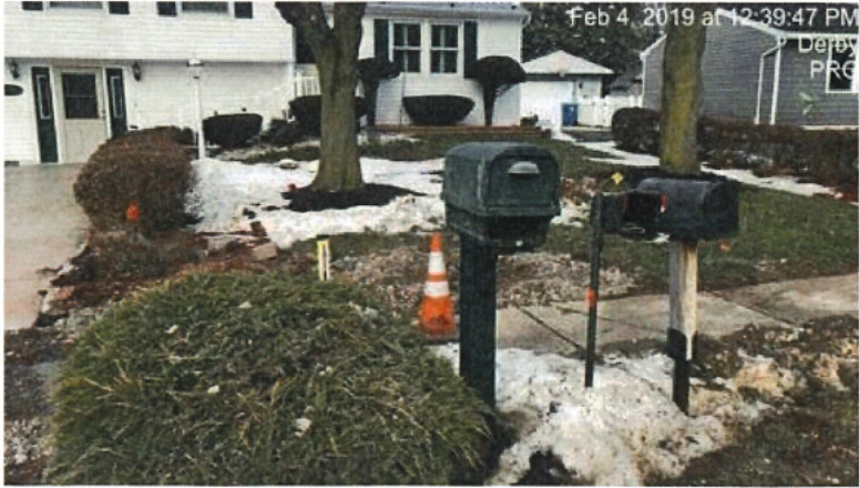
58980 - Investigator9.jpg