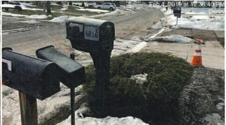
58980 - Investigator4.jpg