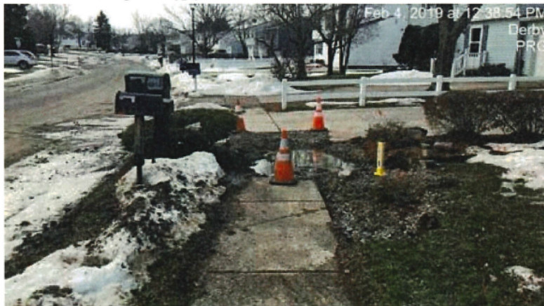
58980 - Investigator7.jpg