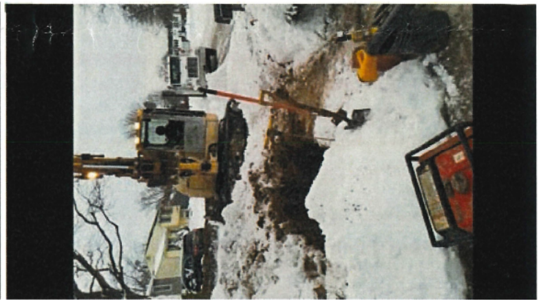
58980 - Investigator13.PNG