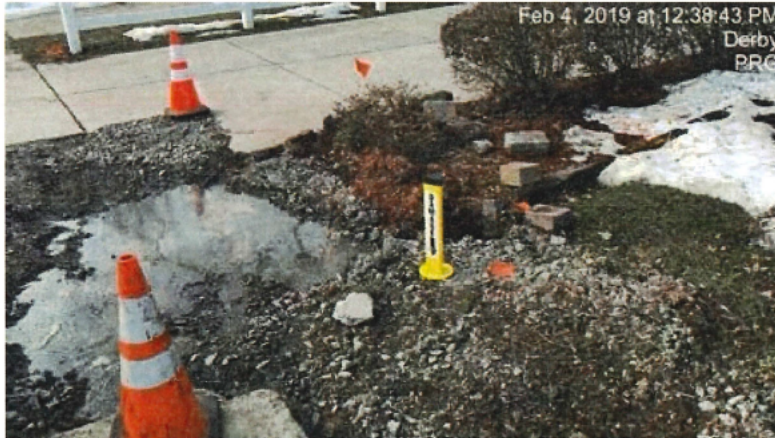
58980 - Investigator5.jpg