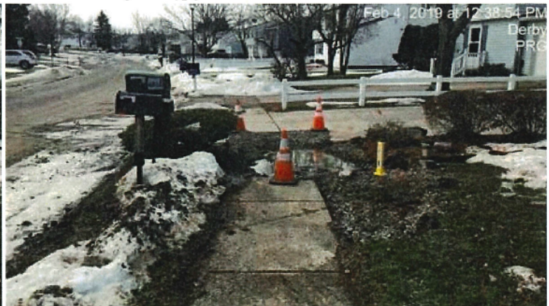
58980 - Investigator8.jpg