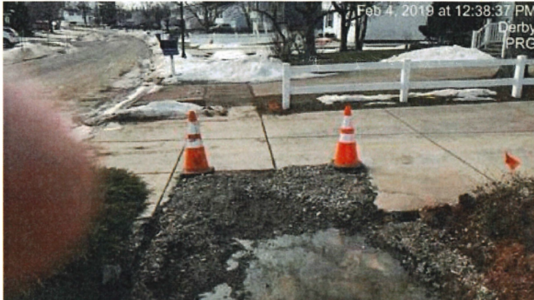
58980 - Investigator3.jpg